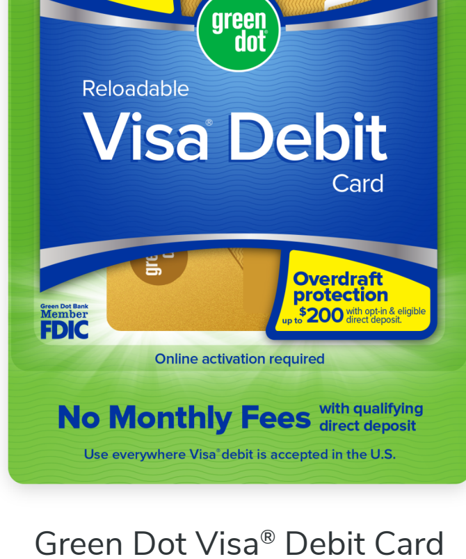
Green Dot Visa® Debit Card

Everyday banking with no monthly fees 1 that helps you budget and manage your money —anytime, anywhere you need it.