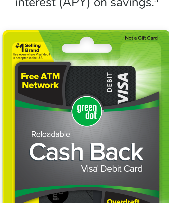
Green Dot Cash Back Visa® Debit Card

Earn 2% cash back on your online and mobile purchases plus earn 2% interest (APY) on savings. 3