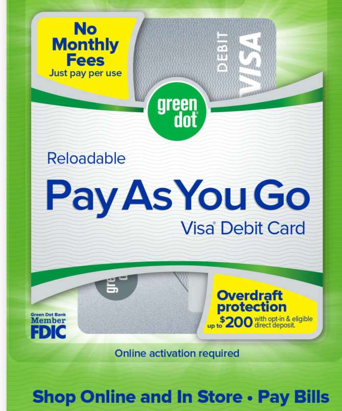
Green Dot Pay As You Go Visa® Debit Card

Simply pay per use 2 and still get everything you need to shop and pay your bills online.